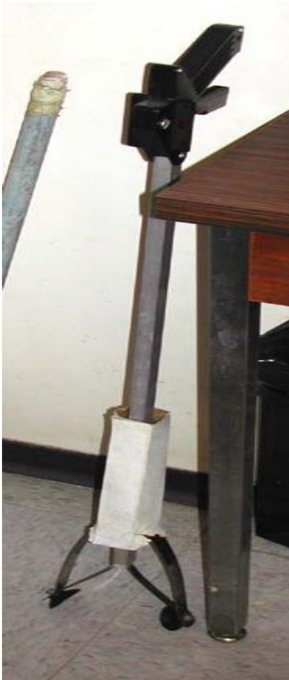
Figure 2: Tongs