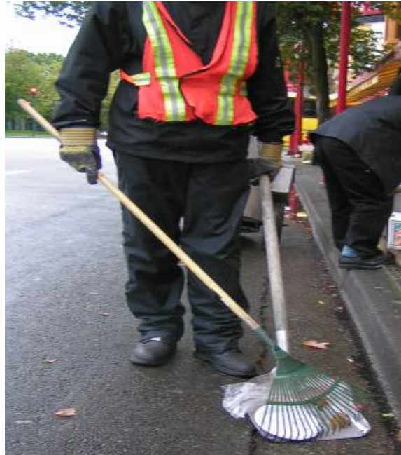
Figure 1: Rake and Shovel

The Motorized Litter Cart Operator has an assigned territory to clean each week. They start their shift at Manitoba Yards. They drive a Ford Ranger pickup truck to their territory. When they reach their cleaning route for the day they will park their truck. They will either use a rake and shovel (see Figure 1) or a broom or tongs and a pail to collect garbage lying in the area. They use the rake to sweep the accumulated debris into the shovel or tongs to pick up garbage. If they finish their daily route early, the Motorized Litter Cart Operator will start the next part of their route.