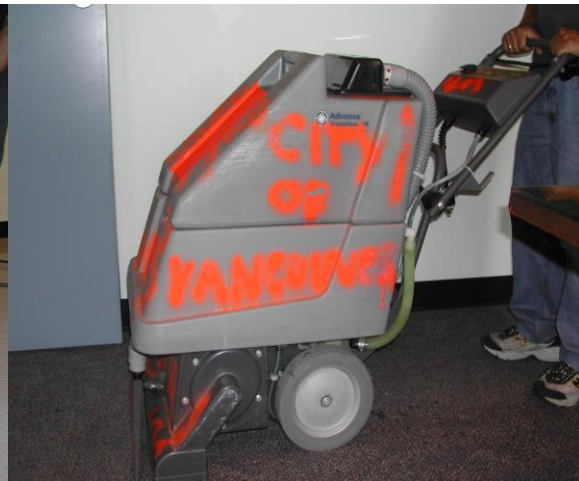
Figure 2: The Carpet Shampoo Machine