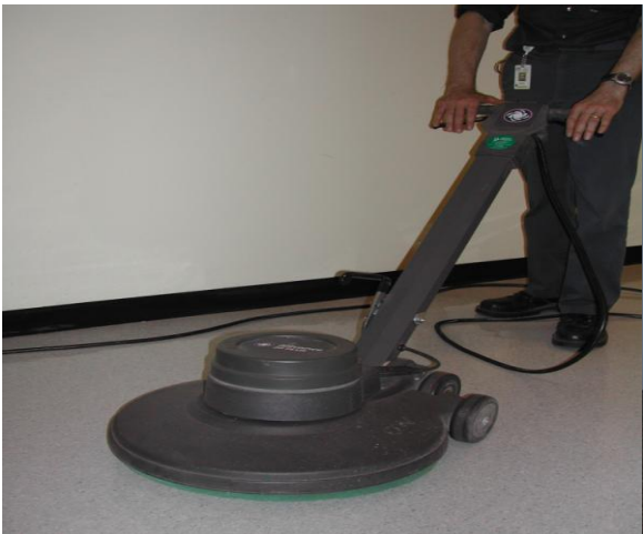
Figure 1: The Power Burnisher

Power tools used by the BSW 1 (Residential) include: power burnisher (see Figure 1 below), up-right vacuum, backpack vacuum, and carpet shampooer.