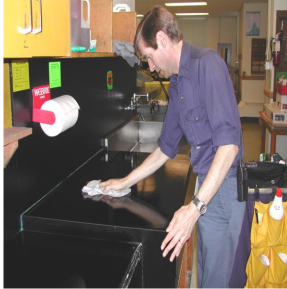
Figure 12: Counter Cleaning

The BSW 1 (Residential) will take a rag from their cart and spray cleaning fluid onto it with a spray bottle. They will then walk to a surface that needs to be cleaned and wipe the area. They wipe around objects on counters and desks to avoid disturbing items. They repeat this process, occasionally rinsing out the cloth at nearby sinks, until the counters in nearby rooms are clean.