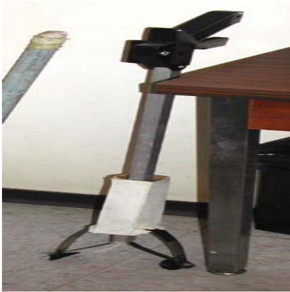
Figure 16: Needle Handler

a trash receptacle. Any needles are picked up using the needle handler pictured in figure 17 and deposited into a used needle container similar to the one pictured in figure 18. The needle container is stored in a secure place, such as the manager's office, to prevent anyone from trying to access the used needles.