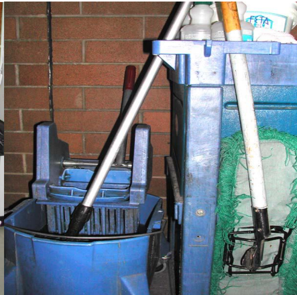
Figure 14: BSW Residential Cart

The BSW 1 (Residential) will move their cart (see the cart in Figure 14) to the areas they need to clean. They then walk around to the personal garbage containers in each area and empty the containers. The garbage containers weigh up to 3 kg. They need to be lifted from floor to waist level. They will then dump the contents of the garbage containers into the cart. If necessary, they will replace the plastic garbage bag in the personal container. The replacement bags are located in the storage compartment of the BSW 1 (Residential) carts. They repeat the dumping of the personal containers until the big garbage bag on their cart is full. Once this happens, the BSW 1 (Residential) will take the garbage bag to the large garbage container pictured in figure 15.