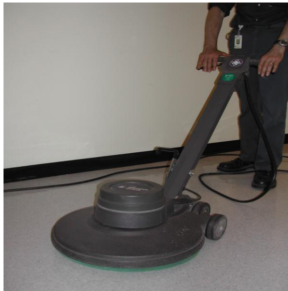
Figure 7: Power Burnisher

After the floors are mopped and allowed to dry, they get burnished. There are 2 types of machines used in the process. The Power Burnisher (see Figure 7) is commonly used to burnish floors. The Burnisher is wheeled to the area to be burnished and is plugged in. The BSW 1 (Residential) turns on the rotating Burnisher head through levers on the handles. They push the Burnisher to move it along the floors. Due to the motion of the bristles on the bottom, the Burnisher will move side