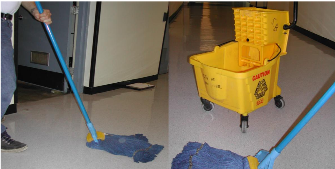
Figure 5: Mopping