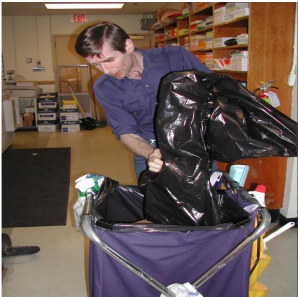
Figure 13: Emptying the Garbage