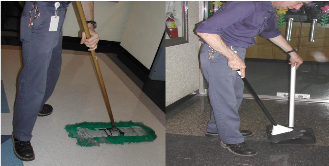
Figure 3: Push Broom