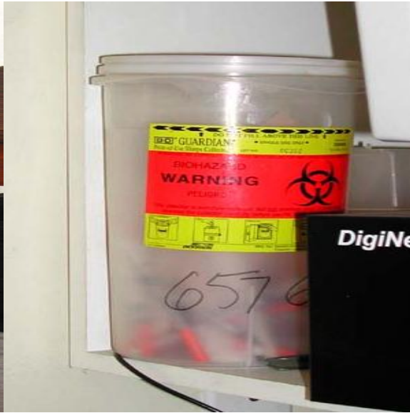
Figure 17: Needle Disposal Container