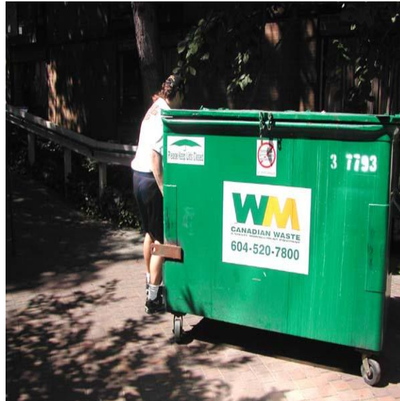
Figure 15: Garbage container

The Building Service Worker 1 (Residential) also checks the rooms where clients go to drop their garbage down a chute. The chute opens up above the large container pictured in figure 15. The BSW ensures that all the garbage has been dumped into the chute and that the chutes are not clogged.