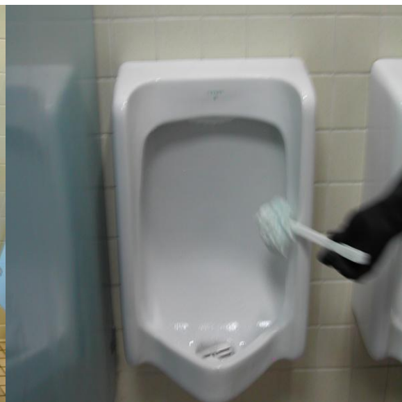
Figure 21: Urinal Cleaning