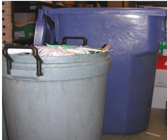
Figure 18: Recycling containers

The Building Worker (Theatre) adds paper into a medium sized recycling container (similar to the one in Figure 18) from the small blue recycling boxes in personal Theatres. There are a variety of medium sized recycling containers. They have a similar size to the grey container in Figure 18, but not all the containers have handles. The personal blue recycling boxes need to be lifted from ground level to waist height to be dumped into the containers. After the recycling containers are filled with recycling, they are lifted from waist height to just below shoulder level to be dumped into the large blue recycling containers. The weight of this medium sized container varies depending on how full the recycling containers are. They can vary between 10 to 30 kg. If necessary, it is possible to get a second Building Worker (Theatre) to assist with the lift. The large blue recycling containers have wheels. After the recycling has been dumped into the blue bins, they are taken to collection areas in each building.