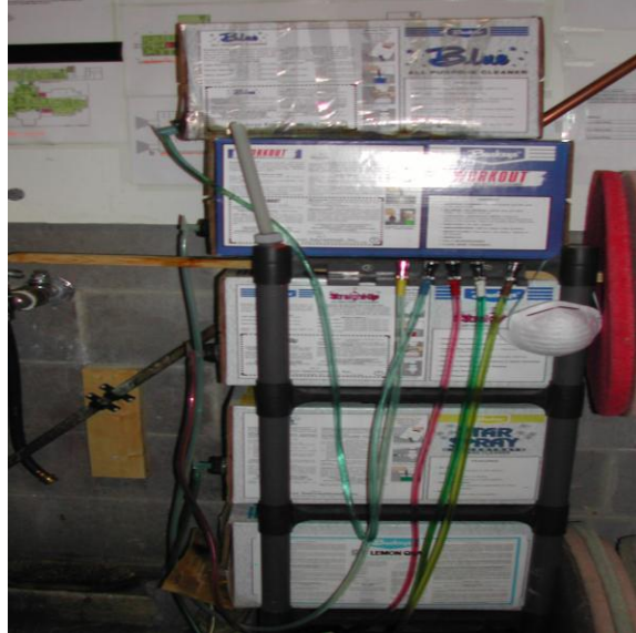
Figure 1: Cleaning Agent Dispenser