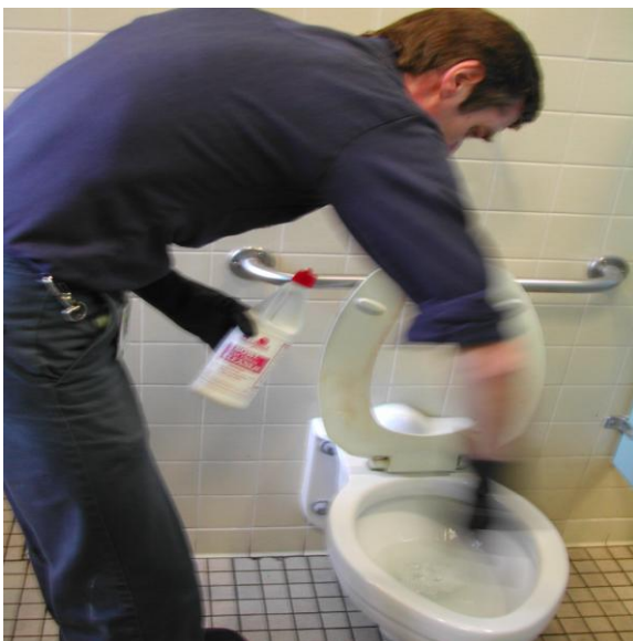
Figure 20: Toilet Cleaning