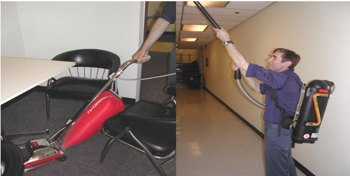
Figure 11: Up-Right Vacuum