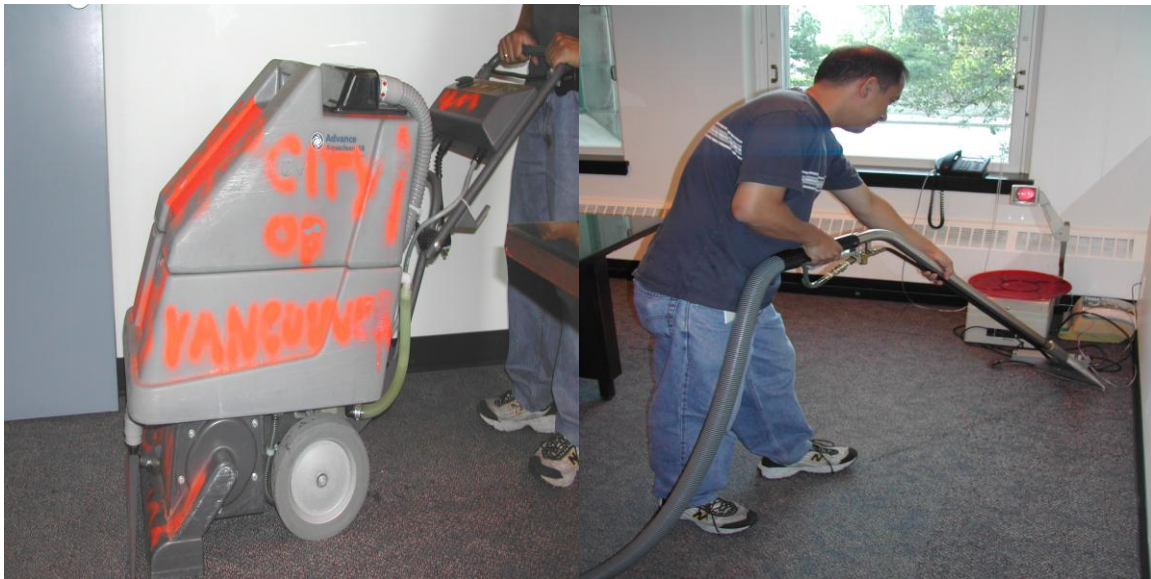
Figure 13: Steam Cleaner