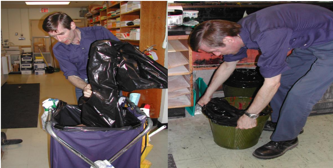
Figure 16: Emptying the Garbage