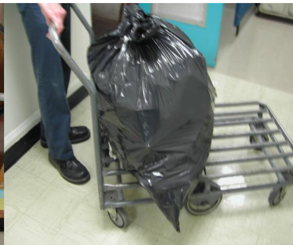
Figure 5: The Garbage Bag Trolley