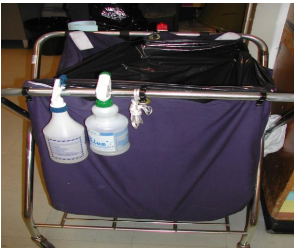
Figure 4: The Garbage Cart

Garbage containers, recycle bins, and carts.