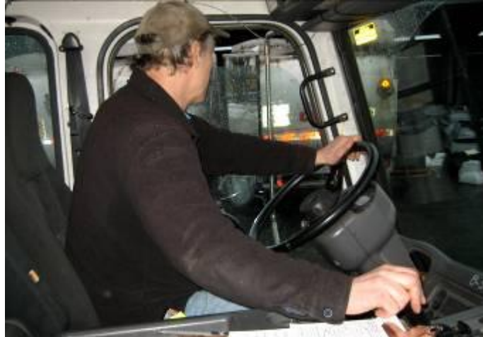
Fig. 6: Driver loading a container from inside the cab using mirrors and joystick.