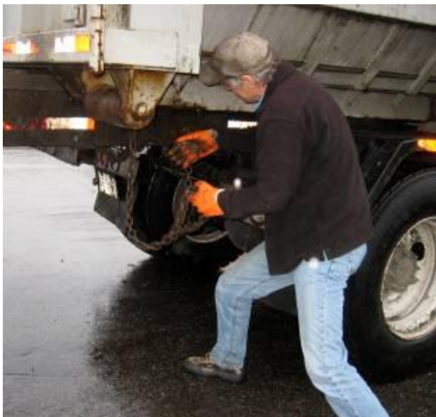
Fig. 7: Driver chaining up a container.