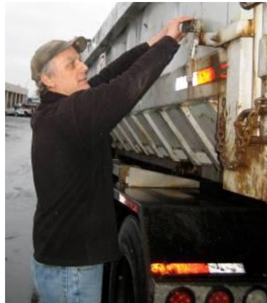
Fig. 8: Driver unlatching container door.

When picking up a full container the container truck driver often drops an empty container in its place before leaving to dump the full container. At other times empty containers might be moved around the yard to make room to access the full containers. The process is the same for hooking up full or empty containers, however depending on whether the container has wheels or not, the container may be pulled onto the back of the truck or the truck may be left in neutral and pulled back under the container. The physical demands for the operator are the same in either situation.