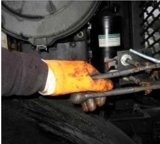
Fig. 5: Load controls on outside of truck.