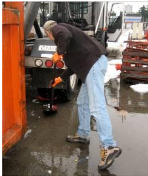
Fig. 10: Driver shovelling debris.