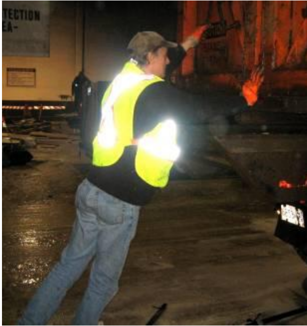
Fig. 9: Driver pushing container door closed in transfer station.

At times contents of the container may spill over the side during pick up or movement of the containers. In that case the operator may be required to pick up a piece of debris and put it back in the container, or he may have to perform some shovelling of debris to clear the area before dropping an empty container back into place (Fig. 10). Every few weeks the driver may be required to climb up onto the truck to grease the rails the container slides onto. As well, occasionally a piece of debris is lodged in the container and the driver may have to climb into the container to free it.