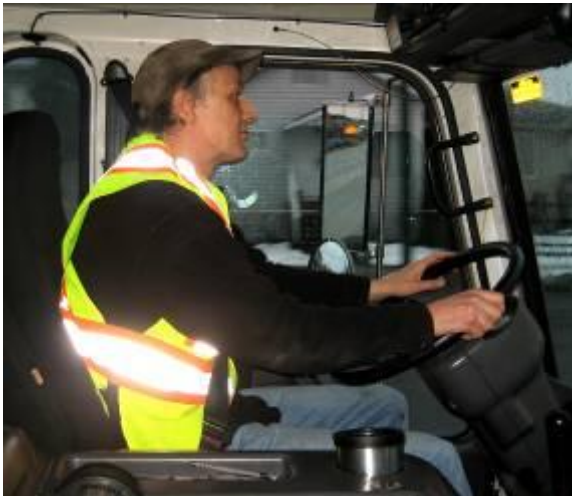
Fig. 1: Driving container truck.

Prior to leaving the yard in the morning the driver performs a pre-trip inspection of the vehicle, checking tires, lights, fluid levels, brakes, windshield wipers and container controls (Fig. 2). If necessary the driver will fill the vehicle with gas either at the beginning or end of the shift. Drivers tend to keep the same truck each day unless a vehicle has to be turned in for maintenance. At the end of the shift a post-trip inspection is performed and a pre/post trip inspection form is completed.