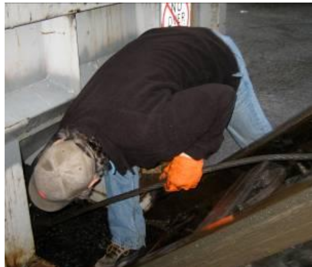
Fig. 4: Driver reaching under container to hook up.

Once hooked up the driver loads the container either using controls inside the truck cab or the controls outside the cab on the side of the truck (Fig. 5 & 6). Once the container is loaded onto the back of the truck the driver chains up the container (Fig. 7) and drives to the dumping location. Accessing chains and feeding them through under the truck can demand some awkward bending and reaching. Chains are not required if just moving a container around the yard. To perform dumping the driver backs up to the dumping area, opens the rear container doors (Fig. 8) and then tilts up the container with the dump controls either inside the cab or on the outside of the truck. Opening or closing container doors may require some force, especially if there is damage to the container (Fig. 9).