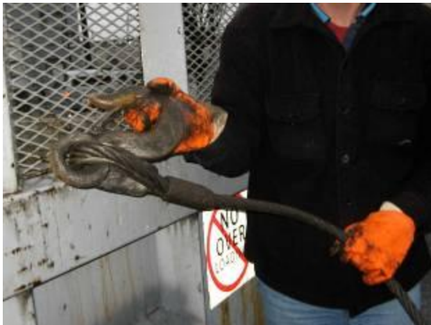
Fig. 3: Close up of hook and cable.

The container truck driver's primary responsibility is to pick up and dump loaded containers from various locations around the city and from the city yard. The types of containers vary, contents vary, and dumping locations vary. To pick up a full container, the driver backs the truck up to the container and then gets out to hook up to the container (Fig. 3). Depending on the type of container, hooking it up might require bending and reaching under the end of the container to the hooking bar (Fig. 4).