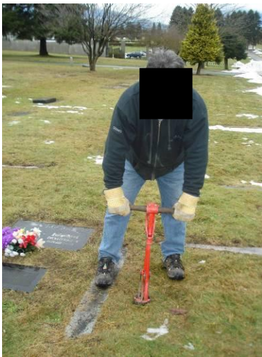
Pushing down on auger