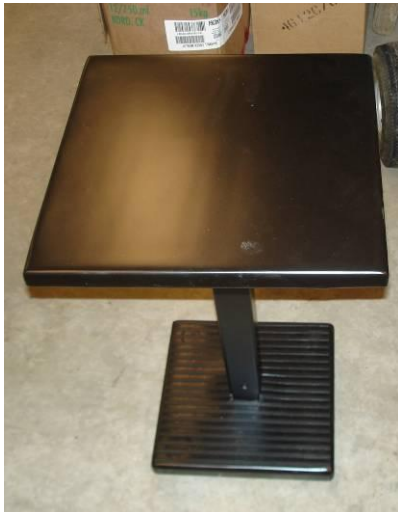
Cremation table (~23 kg)