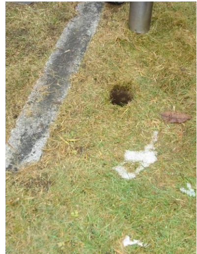
Flower container hole