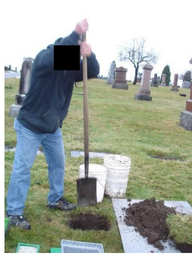
Digging a 2-feet deep hole