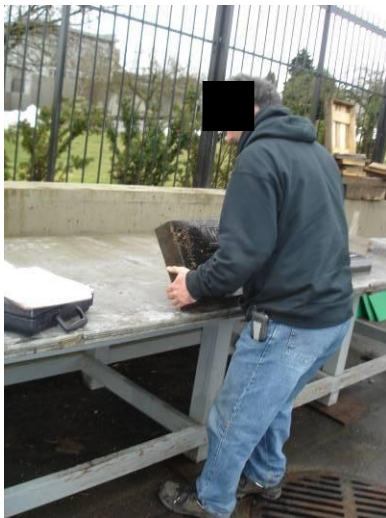
Carrying marker to bench