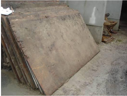
4' x 8' Boards to cover grave

Union: CUPE Local 1004 Reports to: Cemetery Sub Foreman