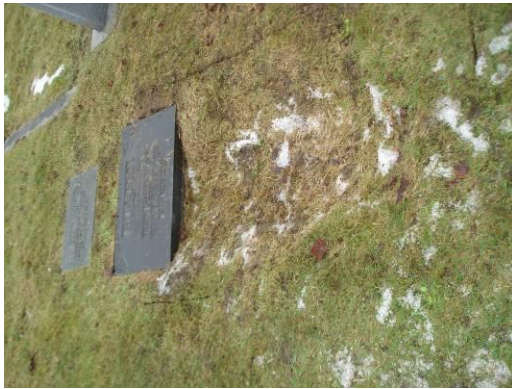
Example of sinkage