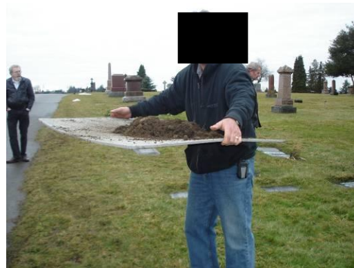
Lifting board with excess soil