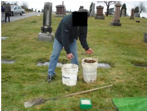
Lifting pails of excess soil