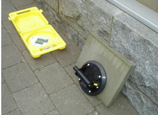
Suction cap and case