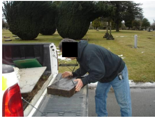
Carrying marker to vehicle