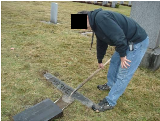
Lifting marker with shovel