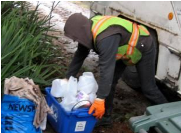
Fig. 3: Bending to lift blue box.

Once the recycling truck reaches the start of its beat the operator switches to working side controls and begins collection. This entails driving at slow speed the short distances between individual residences either on city streets or in back alleys. The driver stops at each residence and gets out to collect the recyclables. The operator typically steps out leading with the right foot each time and the repeated stepping down may occur 800-1100 times per shift. At individual homes there is a blue box for mixed recyclables, a blue bag for newspapers and a yellow bag for mixed paper. The operator lifts each of these 3 items and dumps them into the hopper (Fig. 3). In an average shift an operator may collect at 800-1100 homes. Given that there are typically 3 items at each home this is equivalent to 2400-3300 lifts in a typical shift.