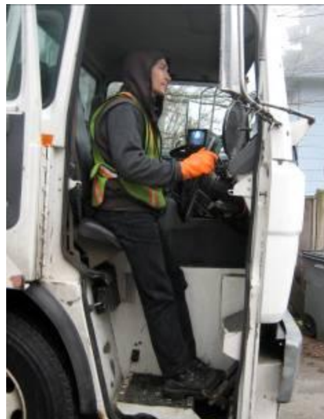
Fig. 2: Driving working side of recycling truck.