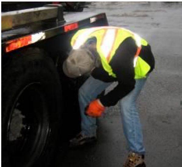
Fig. 1: Example of potential posture for pre-trip inspection.

Typically operators keep the same truck each day. If deficiencies are noted at either inspection or during the course of the day the truck is logged in for repair at the end of the shift. If deficiencies on pre-trip inspection affect the safe operation of the vehicle then the truck is logged in immediately and a different truck is taken out for the day.