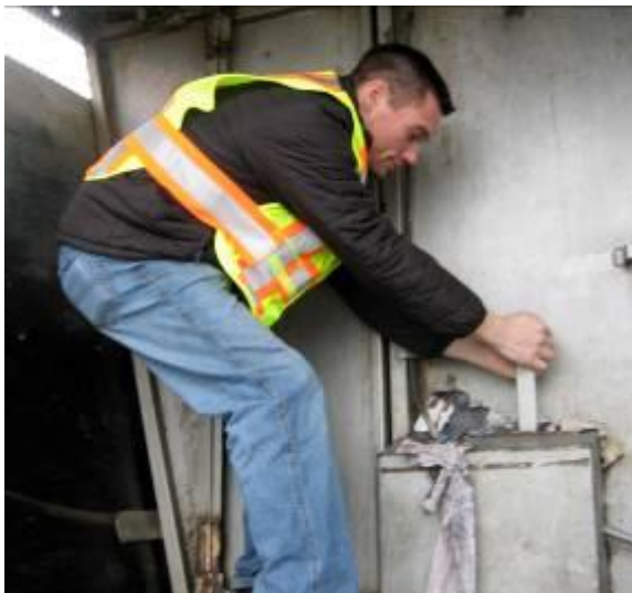
Fig. 9: Locking dividers back into position after dumping.