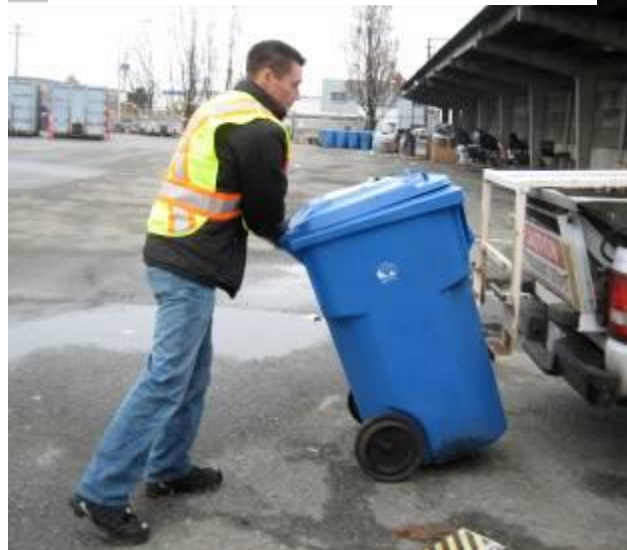
Fig. 10: Locking dividers back into position after dumping.

In the case of the Cushman vehicle, the operator drives as close as possible to the tote, then gets out and manually moves the tote to the back of the Cushman and hooks it onto the lift (Fig.10). He/she then lifts the tote a few inches off the ground using controls on outside rear of the truck (Fig. 11) and drives back to the recycling truck. The operator then removes the tote from the Cushman and hooks it onto the side of the recycling truck and it is then dumped into the back of the truck. The Cushman operator