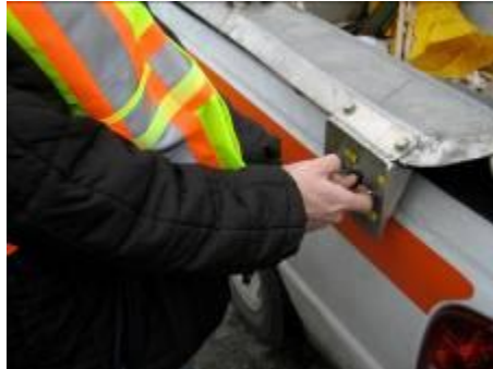
Fig. 11: Cushman lift controls.

then walks the empty tote back to where it came from. The work for the Cushman operator is more physically demanding than for the recycling truck operator on this team because the Cushman operator has to push/pull and otherwise manoeuvre heavy totes up/down curbs, ramps, through gates and other awkward areas to get it to the back of the Cushman. For this reason the Cushman operator and the recycling truck operator typically trade roles during the shift so that each does 50% of the manual work.