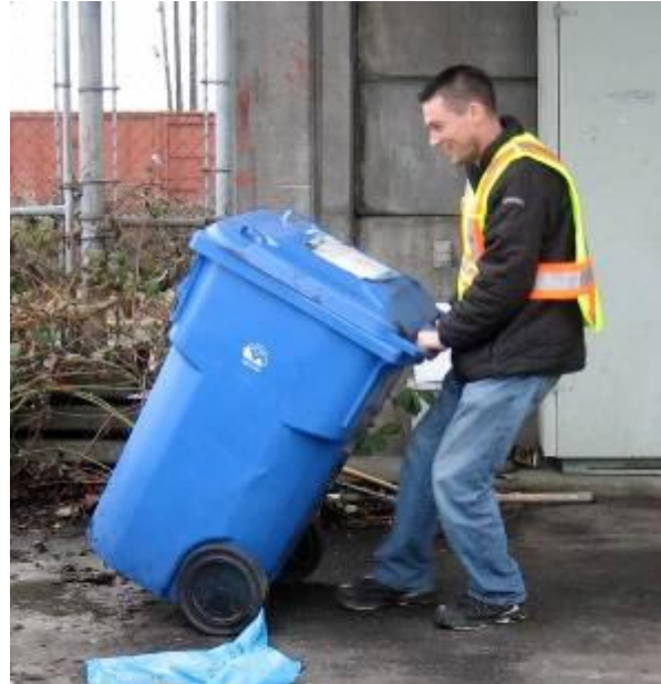
Fig. 6: Moving 360L totes for dumping.

Once the truck is full the operator drives to the dump and dumps each of the 3 types of recyclables in a different area in the dump. The dumping process entails opening the bubble (rear of the truck), backing up to the appropriate area and dumping the load (Fig. 7). The operator uses controls inside the cab to unlock the dividers separating each area in the back of the truck so that each section of recyclables is dumped in turn. After dumping the operator locks the dividers back in place and this may require climbing into the back of the truck and pushing or pulling the divider back into place (Fig. 8 & 9). Typically a truck may dump twice a shift, but if the beat has a lot of tote pick ups that fills the truck faster and they may have to dump more frequently.