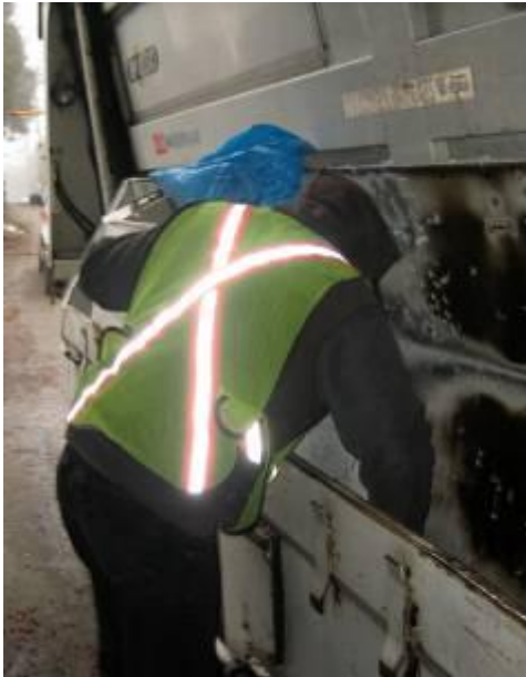
Fig. 5: Reaching into hopper to pull item out from wrong section.

wheels the tote to the recycling truck and hooks it on the side of the hopper and using the same hopper controls, dumps the tote into the truck (Fig 6).