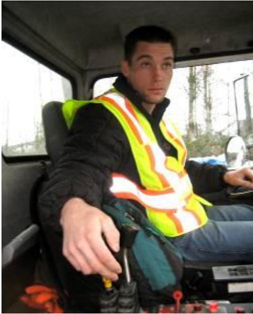
Fig. 7: Operating dump controls at dump site.