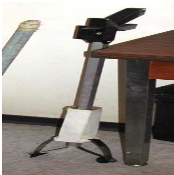
Figure 16: Needle Handler

pan a broom and a needle handling device (see figure 16). They will sweep garbage around the residence into the long handled dust pan and dump it into a trash receptacle. Any needles are picked up using the needle handler pictured in figure 17 and deposited into a used needle container similar to the one pictured in figure 18. The needle container is stored in a secure place, such as the manager's office, to prevent anyone from trying to access the used needles.