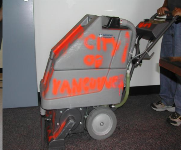
Figure 3: The Carpet Shampoo Machine