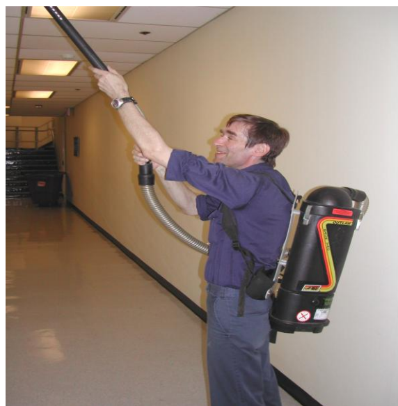
Figure 10: Backpack Vacuum

The BSW 1 (Community Centre) will walk to the nearest room or closet used for storing cleaning supplies and equipment and take one of the canister vacuums to carpeted areas. The BSW 1 (Community Centre) plugs in the vacuum and turns it on by flicking a switch. The vacuum is pushed and pulled across the carpeted areas. It is similar to the one pictured in Figure 9. While vacuuming the BSW 1 (Community Centre) has to move chairs and garbage cans out of the way. The BSW 1 (Community Centre) vacuums around large packages or parcels. Some areas have a great deal of boxes.