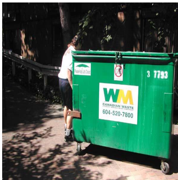
Figure 15: Garbage container

take the garbage bag to the large garbage container similar to the one pictured in figure 15.