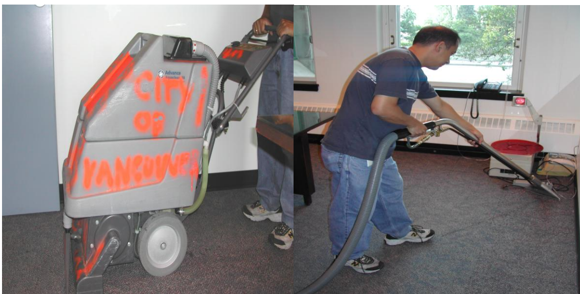
Figure 11: Carpet Shampooer