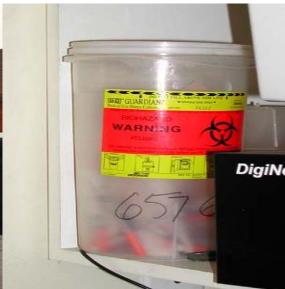
Figure 17: Needle Disposal Container