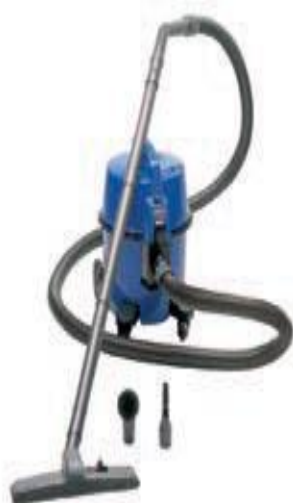
Figure 9: Canister Vacuum