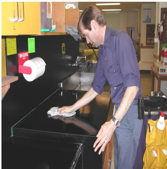
Figure 13: Counter Cleaning

The BSW 1 (Community Centre) will take a rag from their cart and spray cleaning fluid onto it with a spray bottle. They will then walk to a surface that needs to be cleaned and wipe the area. They wipe around objects on counters and desks to avoid disturbing items. They repeat this process, occasionally rinsing out the cloth at nearby sinks, until the counters in nearby rooms are clean.