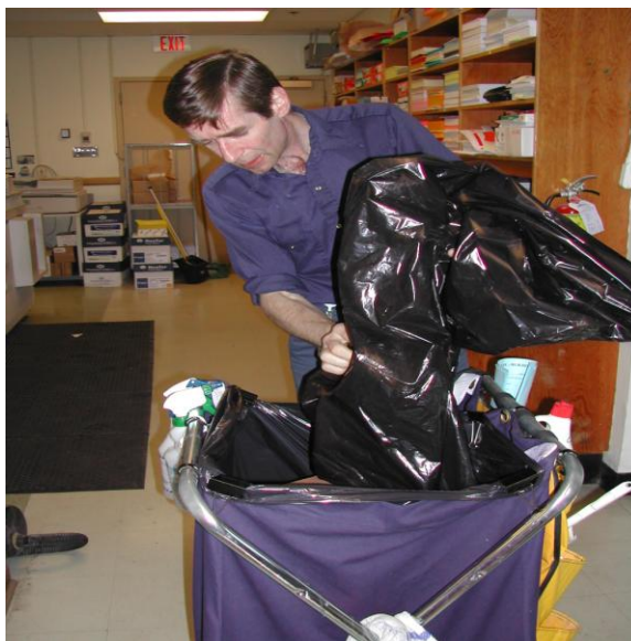
Figure 14: Emptying the Garbage

The BSW 1 (Community Centre) will move their cart (see the cart in Figure 14) or a large garbage bag to the areas they need to clean. They then walk around to the personal garbage containers in each area and empty the containers. The garbage containers weigh up to 3 kg. They need to be lifted from floor to waist level. They will then dump the contents of the garbage containers into the cart or the garbage bag. If necessary, they will replace the plastic garbage bag in the personal container. The replacement bags are located in the storage compartment of the BSW 1 (Community Centre) carts. They repeat the dumping of the personal containers until the large garbage bag is full. Once this happens, the BSW 1 (Community Centre) will