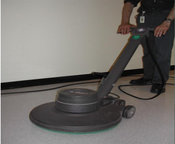
Figure 2: The Power Burnisher