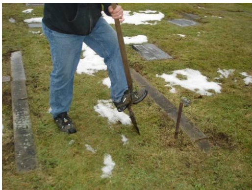
Digging hole around stand pipe