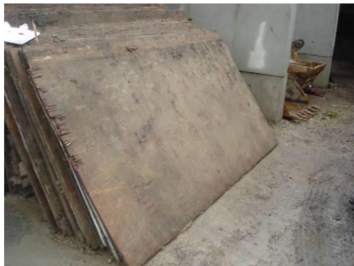
4' x 8' Boards to cover grave

Union: CUPE Local 1004 Reports to: Cemetery Sub Foreman