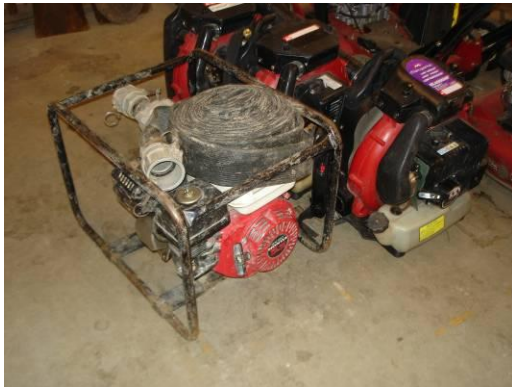
Pump for pumping water out of grave