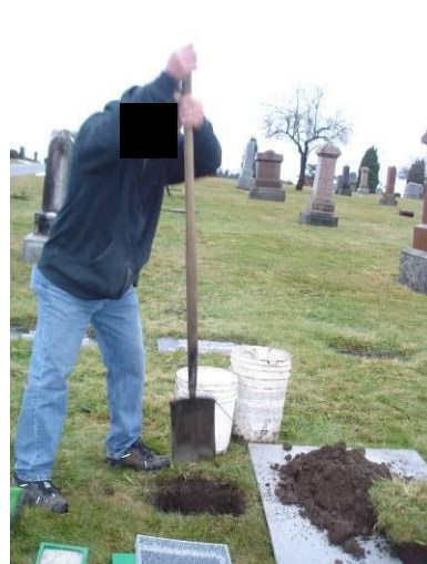
Digging a 2-foot deep hole