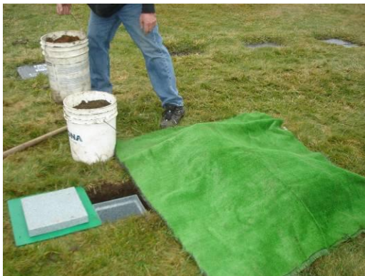
Prepared in-ground ash interment