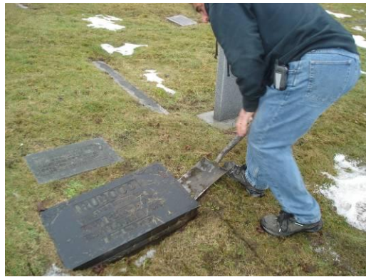
Removing marker prior to repair