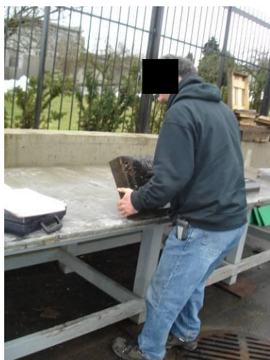
Carrying marker to bench