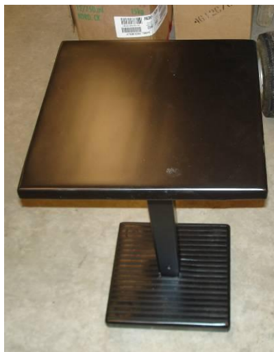
Cremation table (~23 kg)