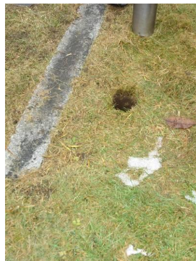
Flower container hole