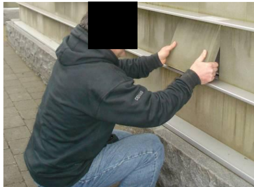
Crouching to remove plate