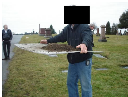
Lifting board with excess soil