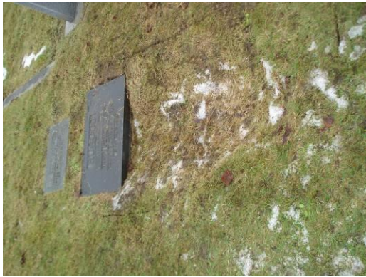
Example of sinkage