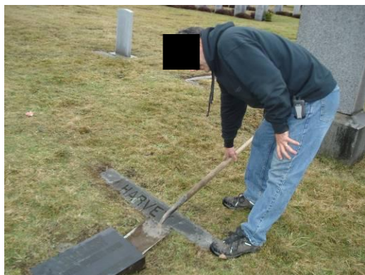
Lifting marker with shovel