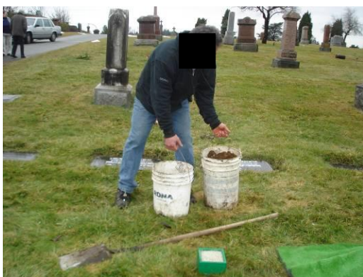
Lifting pails of excess soil