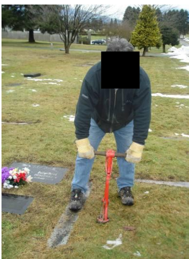
Pushing down on auger