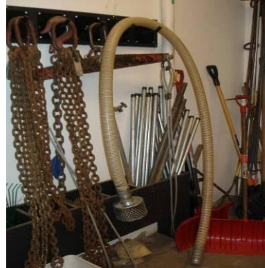
Hose for pumping water