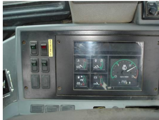
Controls in backhoe cab