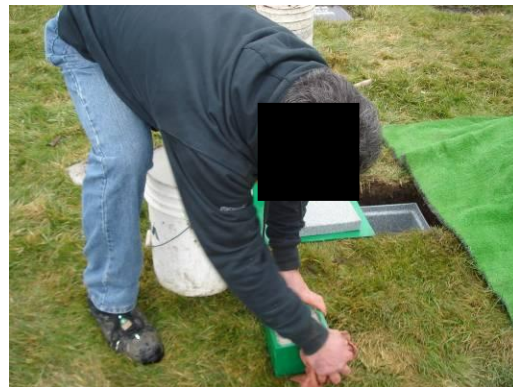
Wiping dust off container