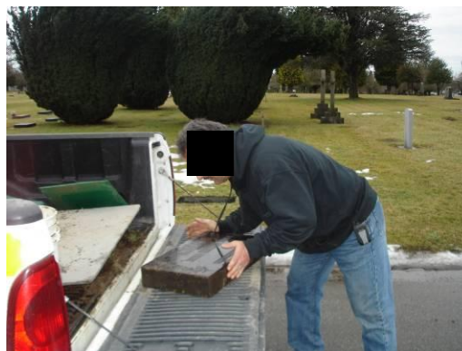
Carrying marker to vehicle