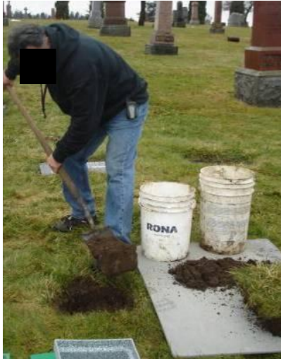
Preparing in-ground ash interment