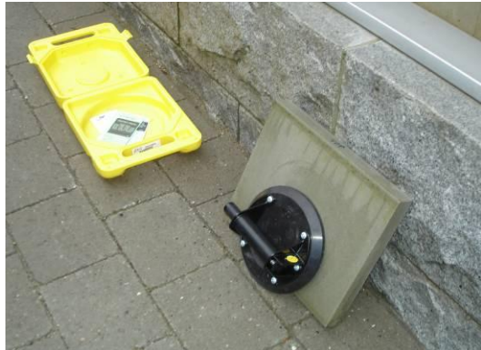
Suction cap and case