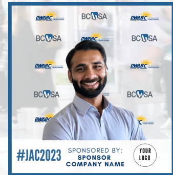
Photo Booth with your company's logo includes push recognition, and recognition in conference guide(1)